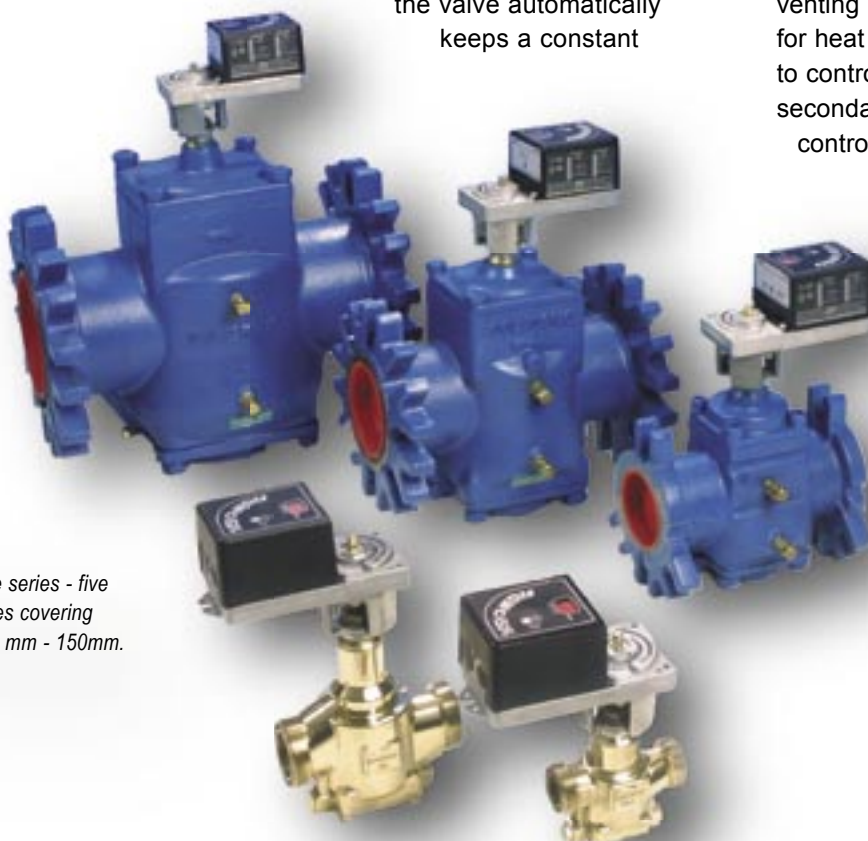
The SM valve series - five different valves covering sizes from 15 mm - 150mm.

The FlowCon SM includes an innovative self adjustment feature which enables each valve continuously to self balance. This ensures delivery of precisely the flow rate required by each terminal unit, independent of pressure fluctuations in the hydronic system. Each FlowCon SM can also be adjusted to set an accurate maximum flow rate limit to each circuit.